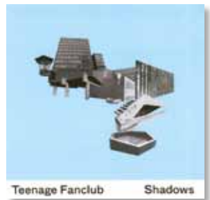
Teenage Fanclub Shadows